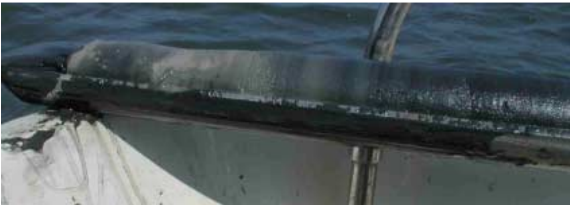
Figure 2. Bottom of core showing laminated mud and the sharp contact with the underlying sand.

Sample 1 was taken near the middle of the borrow pit in 8 feet of water. The top 3.5 feet was composed of dark gray-green mud. There was slight bioturbation, but in most of the core the sediment was laminated. At 3.5 feet there was a sharp contact between the underlying sand and the laminated mud. The sand was nearly devoid of mud and appeared to Pleistocene in age. The sharp contact (Figure 2) and age of the sand indicates that no new sand was deposited or reworked following dredge activities at this location.