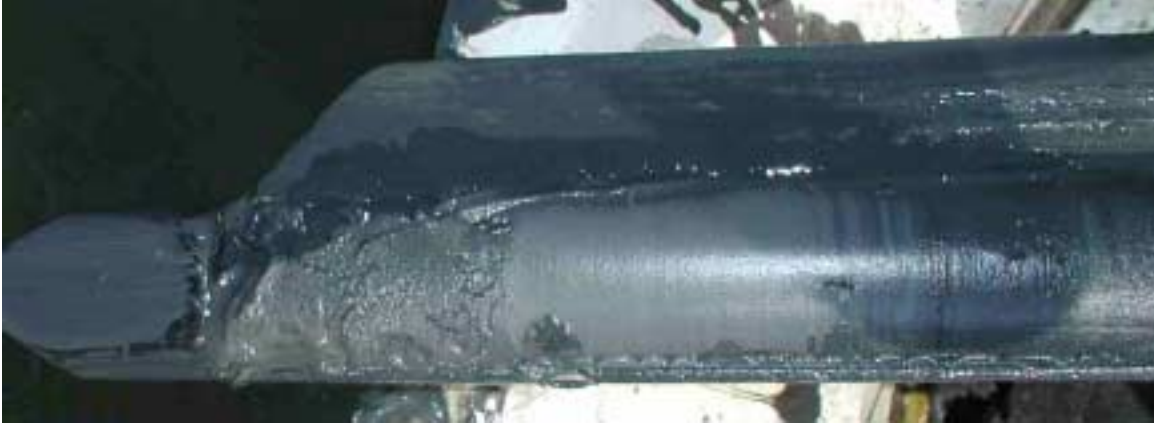
Figure 3. Laminated mud overlying Holocene muddy sand at sample location 2

Sample 2 was taken in 7 feet of water near the edge of the borrow pit. In this location there was 5 feet of laminated gray-green mud. Again, there was a sharp contact with the underlying sandy unit, however the muddy sand sampled at this location was Holocene in age (Figure 3).