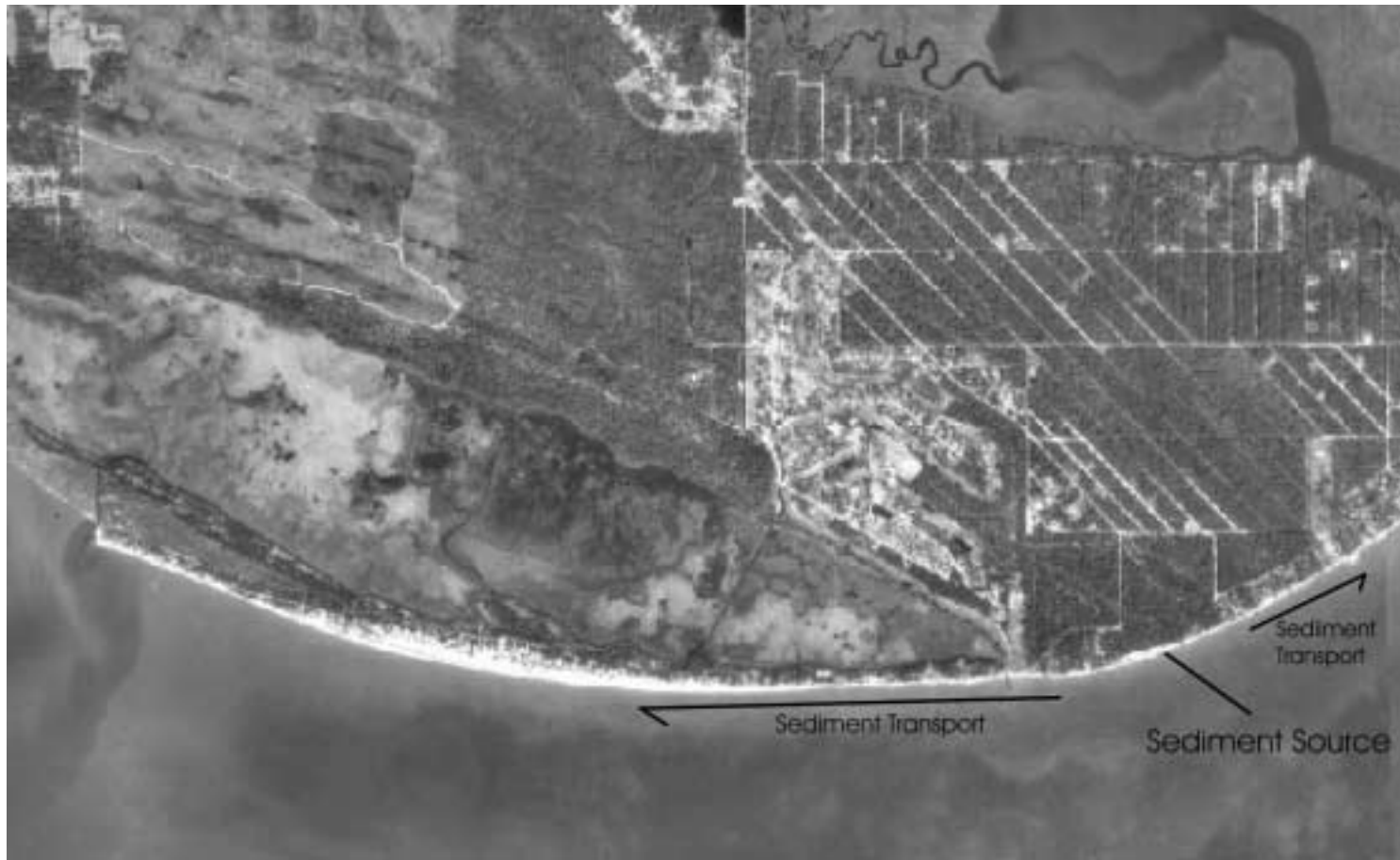
Figure 2. Aerial photograph of the Belle Fontaine beach; north is up. Notice the width and extent of the sand ridges (white on image) running along and also at an angle to the beach.