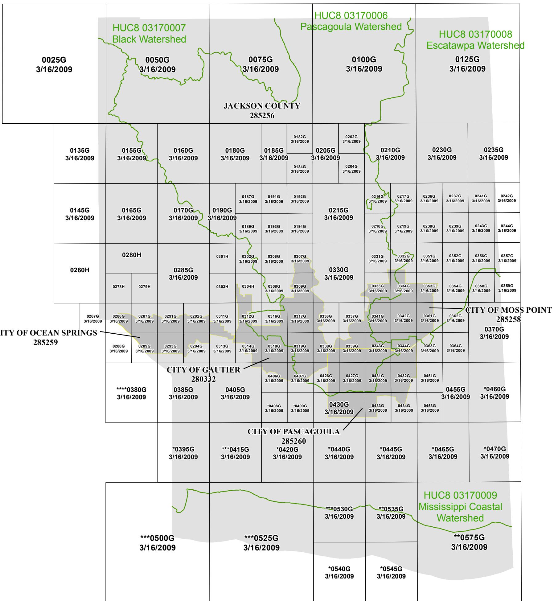
Figure 1: FIRM Panel Index