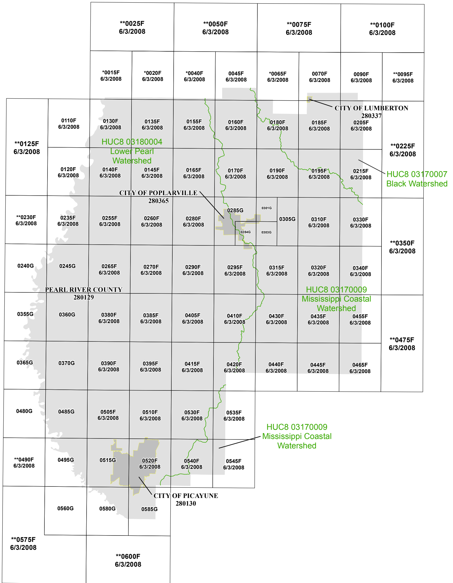
Figure 1: FIRM Panel Index

ATTENTION: The corporate limits shown on this FIRM Index are based on the best information available at the time of publication. As such, they may be more current than those shown on FIRM panels issued before MONTH DAY, YEAR.