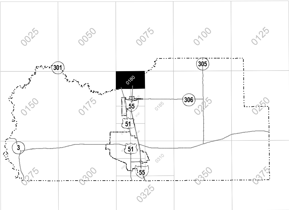
TATE COUNTY AND INCORPORATED COMMUNITIES FIRM PANEL LOCATOR

If you have questions about this map or questions concerning the National Flood Insurance Program in general, please call 1-877-FEMA MAP (1-877-336-2627) or visit the FEMA website at http://www.fema.gov/business/nfip/ .