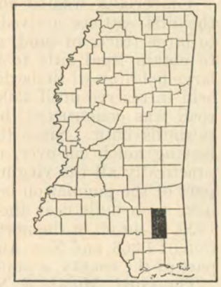
FIG. 53.—Sketch map showing location of Perry County, Miss.

All of the larger streams have formed wide, well-defined valleys. The valley slopes are dissected by numerous small branching watercourses, ranging from perennial streams originating in springs or seeps, whose beds have been cut to a fairly low gradient, to shallow draws or mere drainage ways not marked by channels. Generally these slopes are well suited for farming. Terraces for checking erosion are necessary, mainly on the sloping areas. Many areas on the broad and smoother uplands do not require terracing. In some