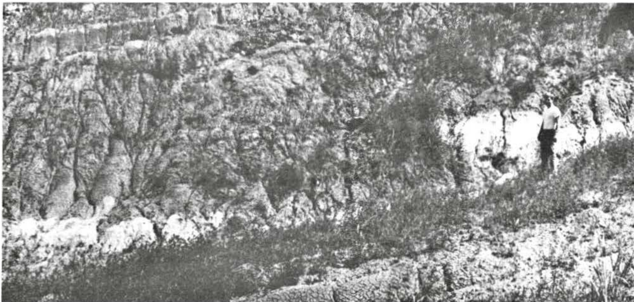
Figure 3. Scott Snyder standing next to unit 2 in the south quarry wall of the Cynthia clay pit at a point where the unit is displaced at the junction of slump blocks. Photograph taken on May 16, 1984.

but an extrapolation of data from nearby wells on the top of the Moodys Branch Formation indicates that this datum occurs at 40 feet below mean sea level or 290 feet below the quarry floor. Based on this extrapolation, the quarry section is correlated with and indicated on the electric log of a nearby test hole shown in Figure 4. This test hole shows the entire thickness of the Yazoo Formation. The upper of two sharp resistivity kicks in the upper clay sequence on the test hole's electric log corresponds to the position of the lithified zone (unit 2) of the measured section at Cynthia.