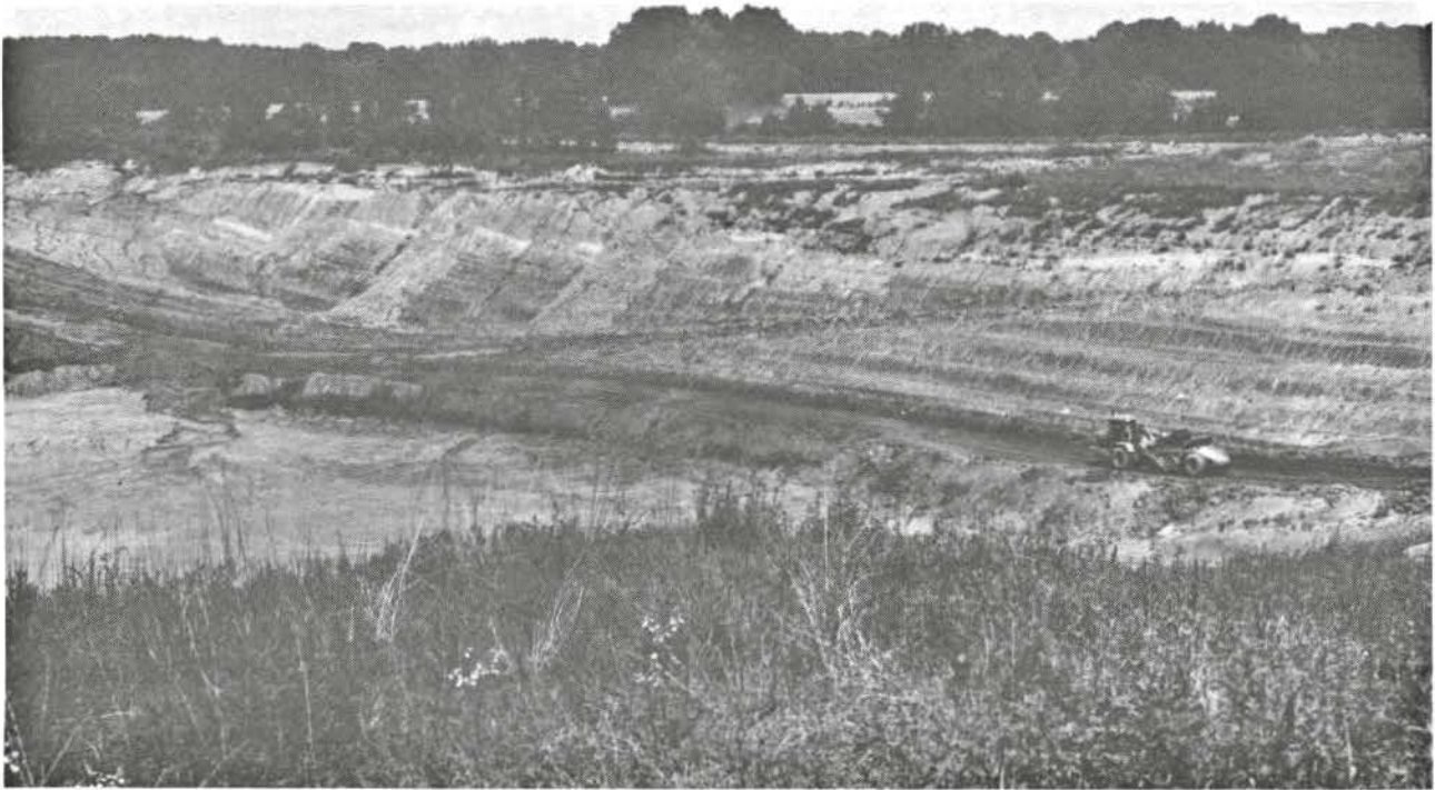
Figure 1. View of the south quarry wall of the Cynthia clay pit (MGS locality 15) in the SE/4, SW/4, Section 25, T. 7 N., R. 1 W., Hinds County, Mississippi. The highly calcareous clay bed of unit 2 in the measured section can be seen as a narrow white band along the upper part of the quarry wall. This unit is displaced and tilted at junctions between slump blocks. Photograph taken on May 16, 1984.