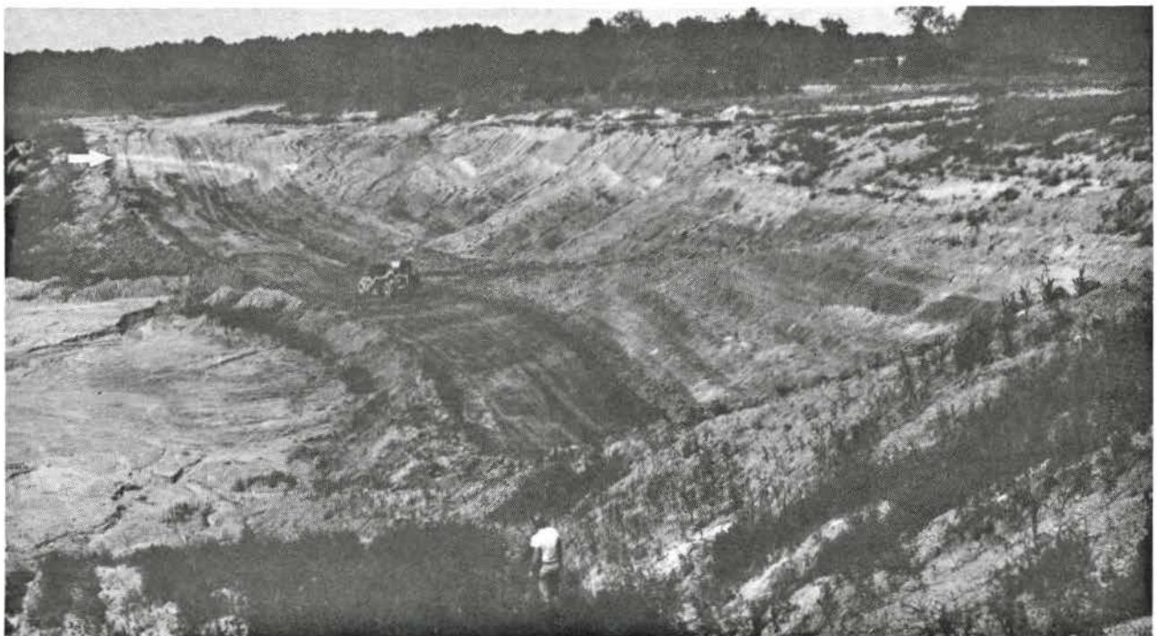
Figure 2. Scott Snyder standing next to an exposure of unit 2 on the west quarry wall of the Cynthia clay pit. An arrow indicates the position of unit 2 on the east wall. Photograph taken on May 16, 1984.