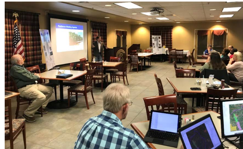
Lower Pearl River Resilience Meeting, Poplarville, MS, November 7, 2019.