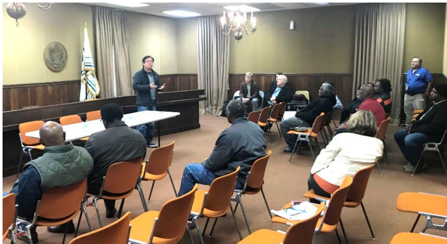
Upper Yazoo Watershed Outreach Meeting, Lexington, MS, November 8, 2019.

Red indicates next planned or scheduled event or meeting.