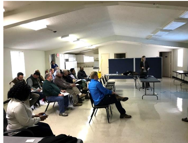
Abiaca Creek Levee LAMP Meeting, Tchula, MS, March 19, 2019.