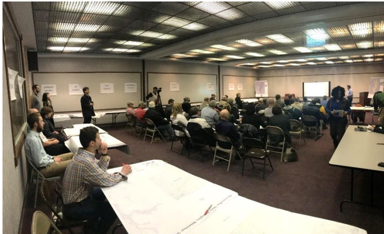
Discovery Meeting Amory, MS, February 21, 2019.

Red indicates next planned or scheduled event or meeting.