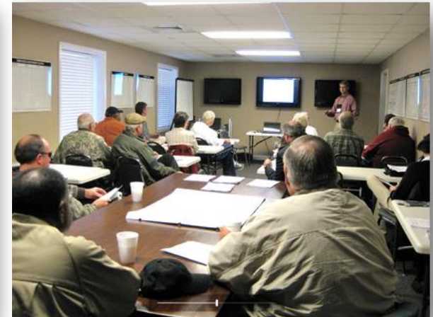
Past Flood Map Meetings with different Mississippi communities.