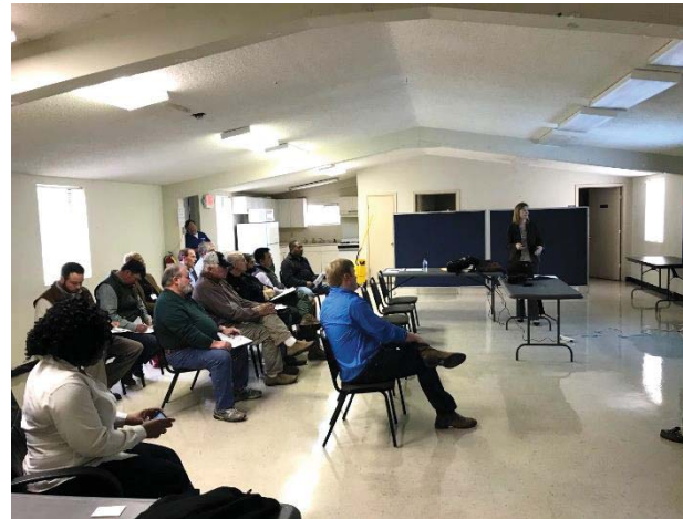
Abiaca Creek Levee LAMP Meeting, Tchula, MS, March 19, 2019.