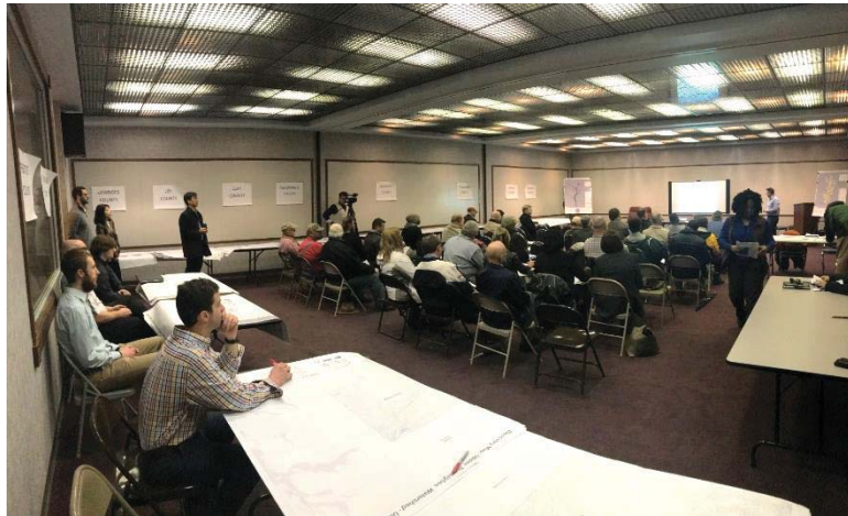
Discovery Meeting Amory, MS, February 21, 2019.

Red indicates next planned or scheduled event or meeting.