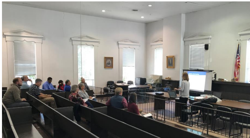
Potococowa Creek Levee LAMP Project Meeting in Carrollton, MS.

Red indicates next planned or scheduled event or meeting.